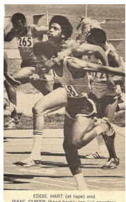
EDDIE HART (left) and ISAAC CURTIS (right) competing in the 100-meter sprint.

Prior to Mr. Hart's graduation he made history when he and Isaac Curtis finished 1st and 2nd at the National Collegiate Athletic Association Championships, at Des Moines, Iowa in 1970. A feat that still stands today, over thirty-three years later. In 1972 Eddie equaled the world record in the 100 meters winning the finals at the Olympic Trials in Eugene, OR. He also completed on the US Olympic team in the 4x100 meter relay, which broke the world record, making him an Olympic Gold Medalist and Olympic record holder.